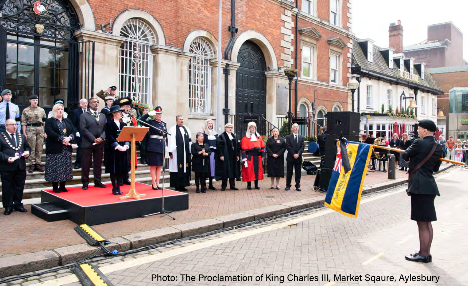
Photo: The Proclamation of King Charles III, Market Square, Aylesbury